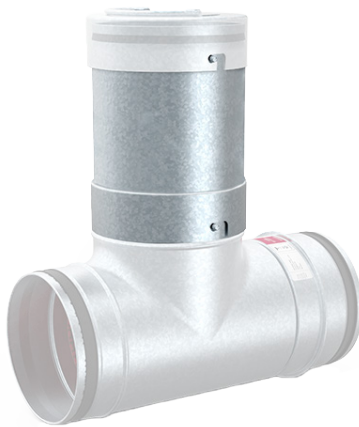
Basic 4 with inspection pipe extension

The inspection pipe extension is used when you want to cover BASIC and the ducts with insulation, or with loose wool insulation.